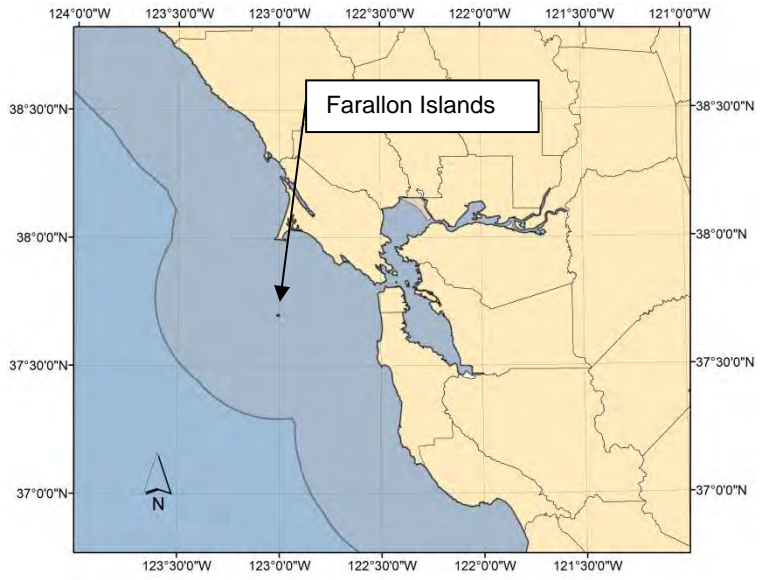
Figure 1b. Bay Area Detail