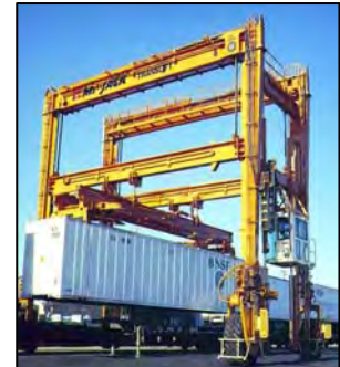
Rubber-Tired Gantry Crane

The California Air Resources Board (ARB) has in place a regulation, which took effect in 2006, to reduce emissions from mobile cargo handling equipment (CHE) operating at California's ports and intermodal rail yards. The regulation requirements, which are in section 2479 of title 13 of the California Code of Regulations, are applicable to all diesel-fueled equipment used at a California port or intermodal rail yard to lift or move containers, bulk or liquid cargo, or to perform routine or predictable maintenance and repair activities. Equipment at low-throughput ports meeting certain criteria are exempted.