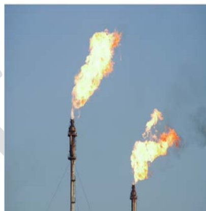
Figure 5-2. A photograph of a flaring event at a refinery.

Two main air quality priorities related to refinery emissions were identified by the Wilmington, Carson, and West Long Beach Community Steering Committee (CSC): (1) emissions from flaring events, and (2) emissions and leaks from refining process equipment and storage tanks. To address these priorities, the CSC has identified the potential need for additional regulation that requires more stringent air pollution controls on refinery process equipment and flaring, and an improved process for notifying the public of refinery flaring events and associated air emissions. Details for these actions are described below.