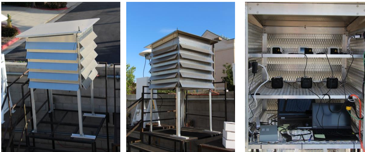
Figures 1a-c. AQ-SPEC's Sensor Shelter at Rubidoux AMS

A louvered aluminum shelter was designed and constructed to house the non-ruggedized air quality sensors from inclement weather conditions, such as heavy rain, strong winds and harsh sunlight. The shelter's main cabin is approximately 3 x 3 x 3 (L x W x H in feet) with louvered vents and a mesh floor to allow for air circulation. The shelter has three aluminum mesh shelves upon which the sensors are placed for the extended field deployment. The shelter is designed in a manner to provide movement of air through the enclosure in order to provide a near-ambient conditions environment for both gases and particulate matter.