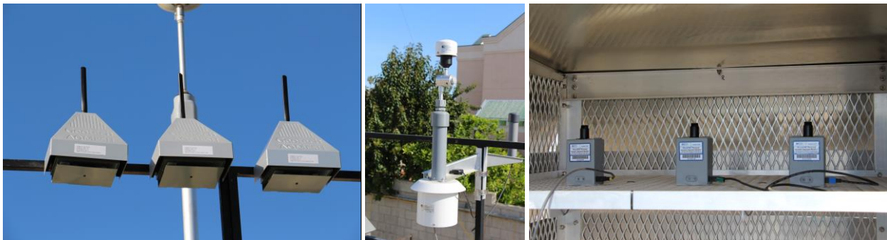
Figures 3a-c. AQ-SPEC's Sensor Field Evaluation Mounting Examples

Upon successfully passing of the bench test, the sensors are brought to one the SCAQMD air monitoring stations. If the sensor is ruggedized for inclement weather, the sensor may be mounted on to a railing on the top of the air monitoring station. If the sensor is not ruggedized or not mountable, the three units of the same sensor model are placed on a shelf in the sensor shelter enclosure. Adequate power is provided for the sensors and data acquisition is established according to manufacture specification or sensor capabilities. Sensors are then exposed to ambient air for a period of 30-60 days. Sensors are checked once a week to ensure that they are operating properly and continuously data logging. If data is stored locally, collection of the data takes place at a reasonable frequency to ensure that data is not overwritten.