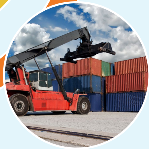
Others (including top/side handlers, reach stackers, forklifts, railcar movers, loaders, dozers, aerial lifts, excavators, etc.)