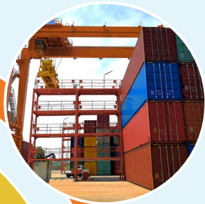
Rubber-Tired Gantry (RTG) Cranes

Any motorized vehicle used to handle cargo delivered by ship, train, or truck, or used for scheduled or routine maintenance activities