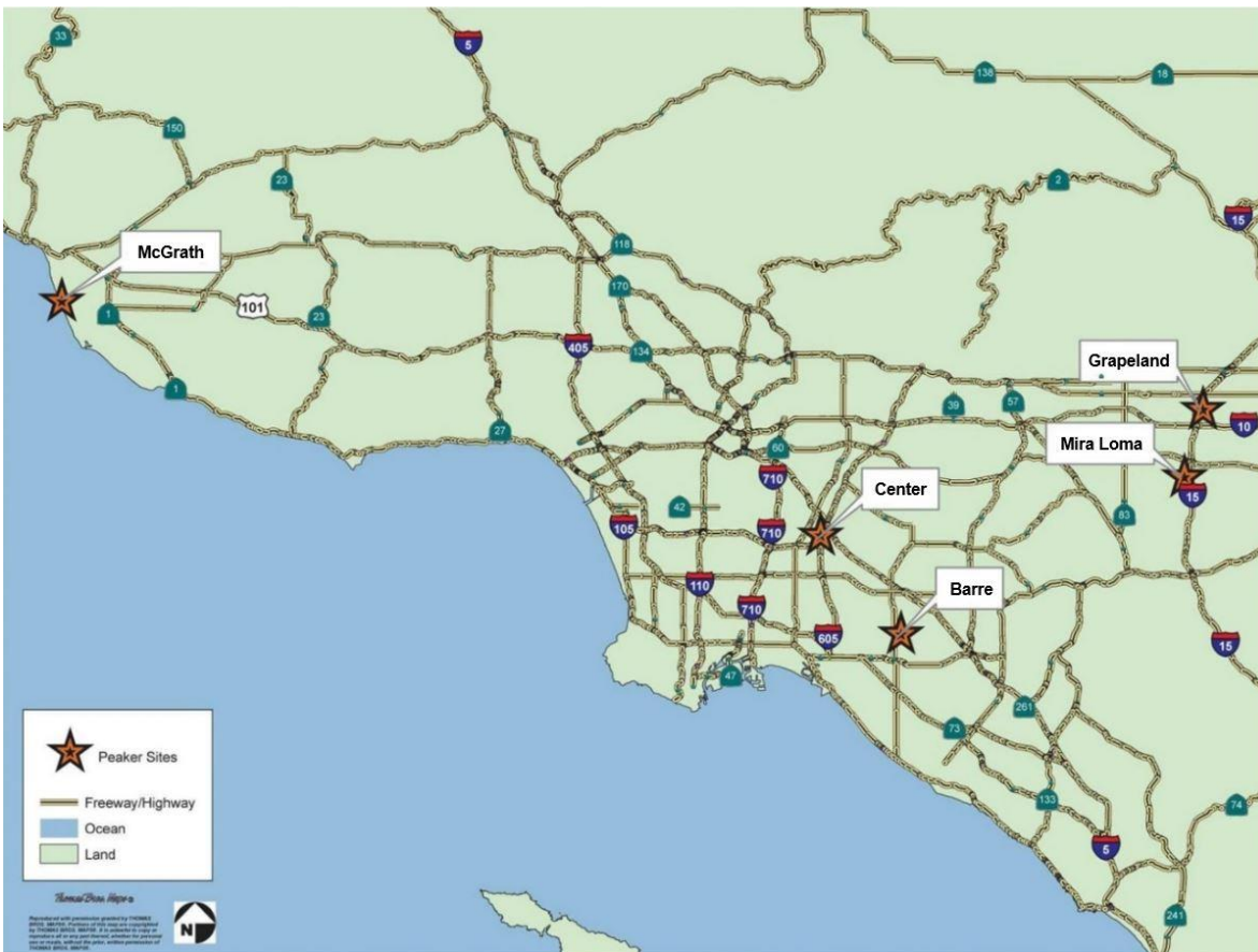
Figure 4-1: Location of SCE's Five Generation Peaking Plants

On August 15, 2006, the California Public Utilities Commission (CPUC) issued an Assigned Commissioner's Ruling (ACR) addressing electric reliability needs in Southern California for the summer of 2007 and beyond. The August 15, 2006 ACR included a reference to the CAISO's August 9, 2006 letter to the CPUC that urged the CPUC to direct the state's investor-owned utilities to solicit a combination of quick-start generation and demand response opportunities that could be developed quickly (less than a year) to increase available electrical supply at the peak hours and to enhance grid reliability. To implement this directive, SCE took steps to install five separate peaking generator projects either within or near existing substations at five strategic locations around Southern California. Figure 4-1 shows the relative locations of the five facilities, all of which were constructed and are operating as mandated by the CPUC. The Mira Loma Peaker is one of the five generation peaking facilities developed by SCE.