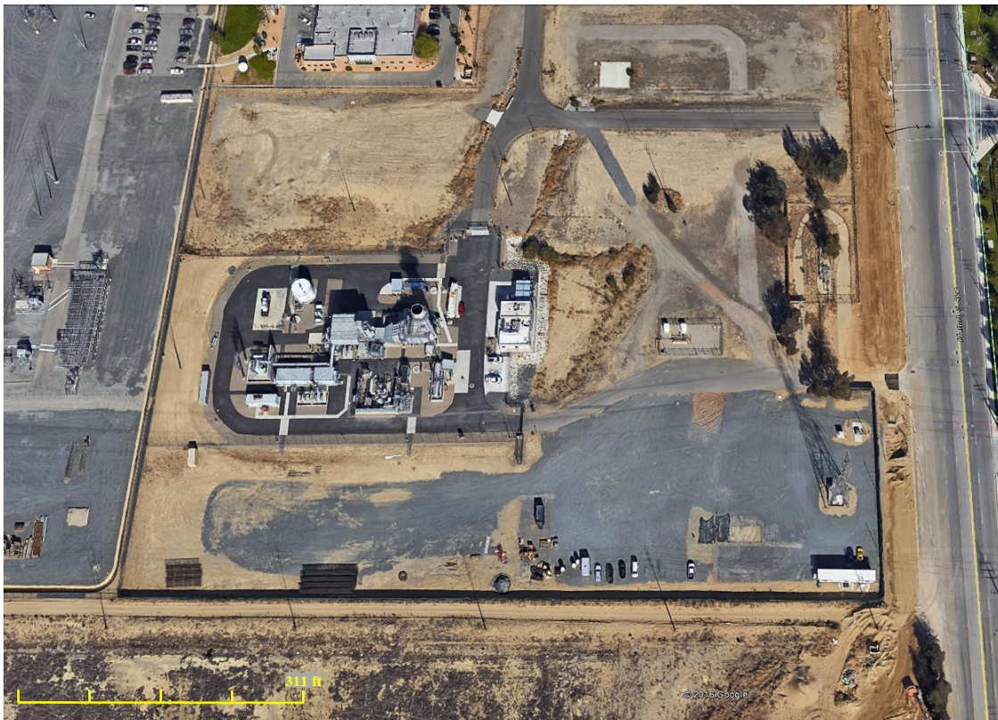
Mira Loma Facility View